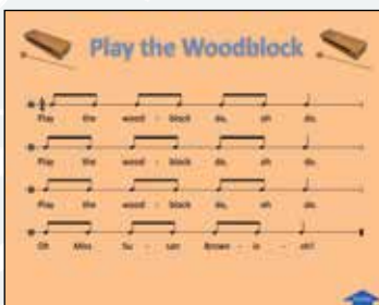
Rhythm and Text